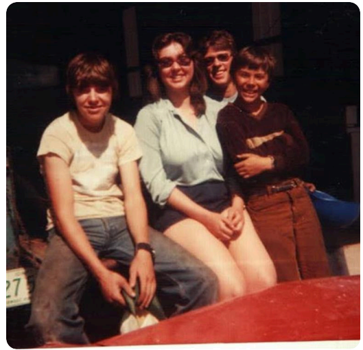
working on vehicles