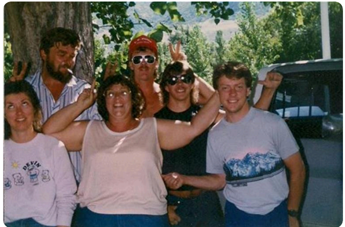
siblings and parents