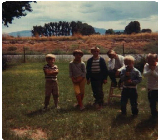
cousins and siblings