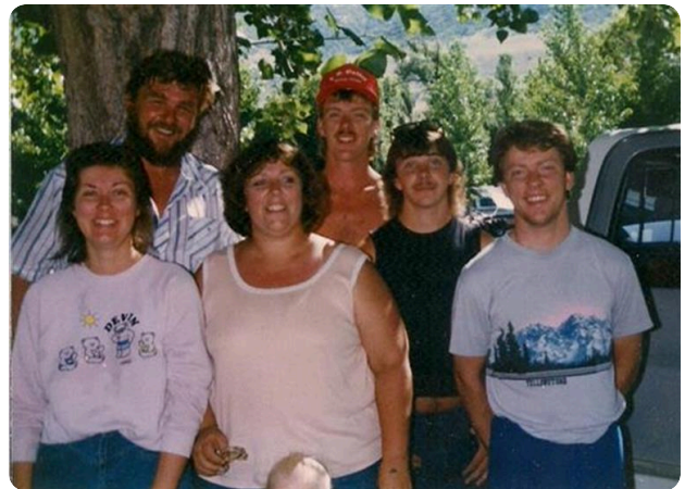
siblings and parents